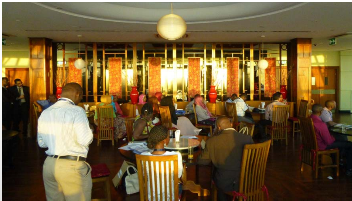
Cross section of Young Professionals during the cruise on the Nile