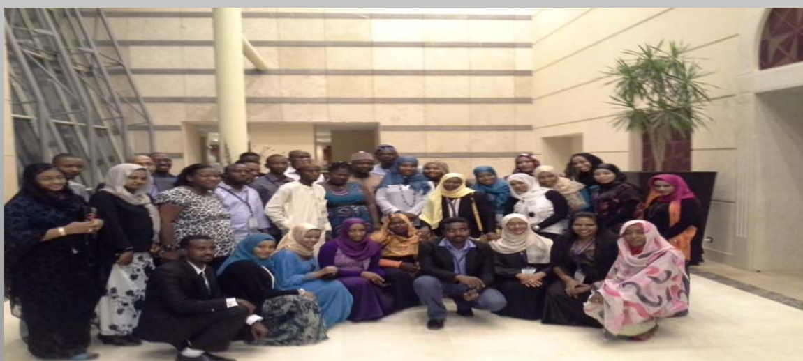
Some African Professionals in attendance at 2013 Conference in Sudan

The steering Committee has continued to meet monthly online and have developed their business plan. It is the aim of this committee to continue to be a strong unified voice for the young professional in the GAMA Community and meet face to face at FIDIC & GAMA conference while providing a forum for the young to grow, find expression both locally and internationally and network with their peers all over the world with the aim of being responsible to their communities as trusted advisers and industry leaders of the future.