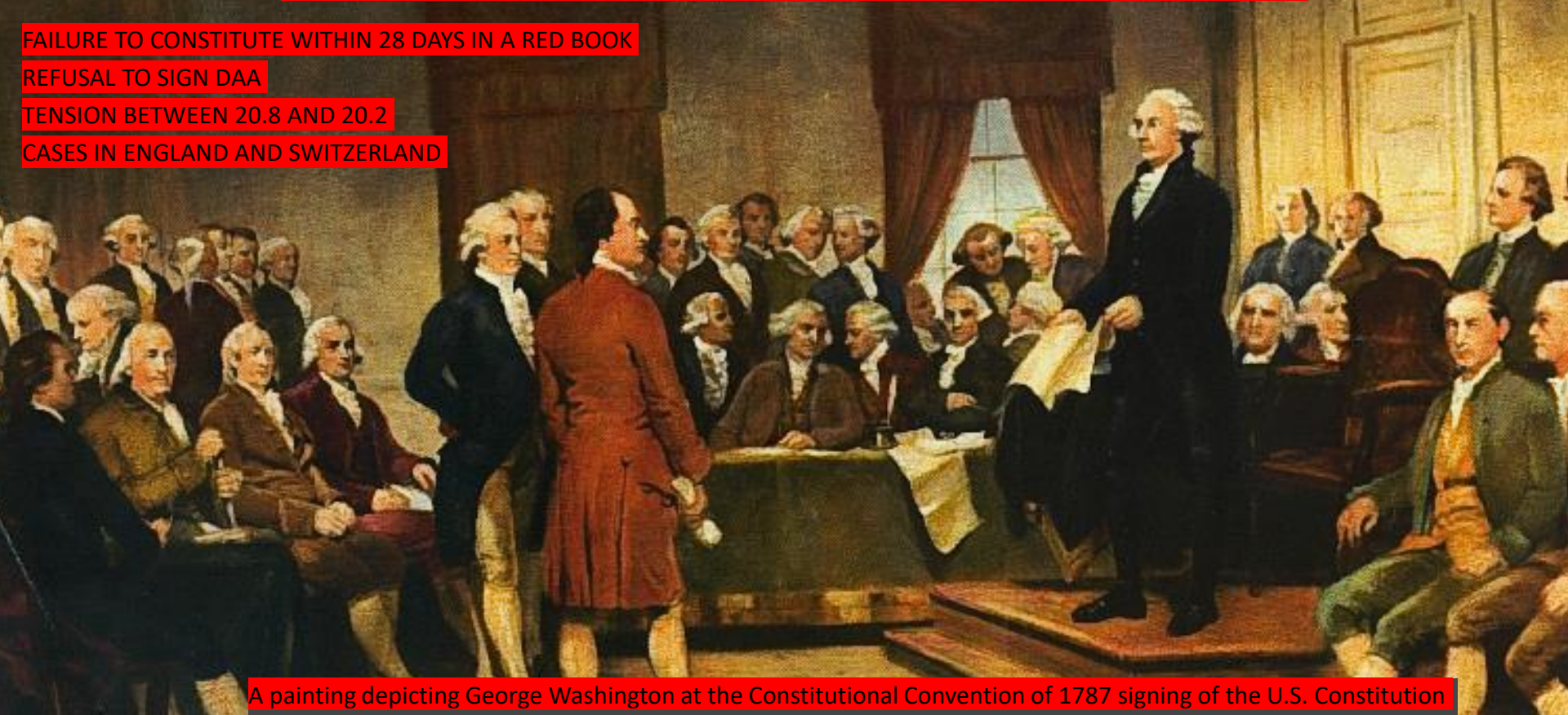
A painting depicting George Washington at the Constitutional Convention of 1787 signing of the U.S. Constitution