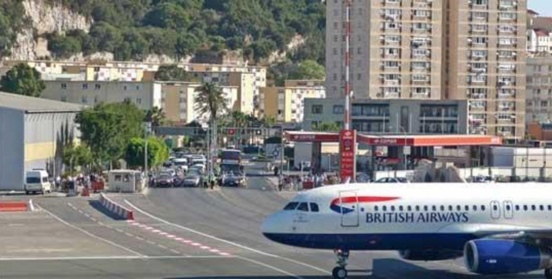
Gibraltar Tunnel case in England