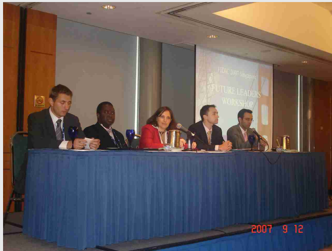
Future Leaders Workshop Presentation, Singapore 2007

The program is called the Future Leaders Workshop. It is attended by senior members of the FIDIC community, as well as junior and emerging leaders, for the opportunity to hear the voice of Young Professionals' regarding the emerging trends in the industry and the future of our professions.