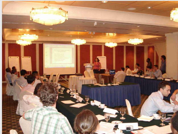
Participants discuss their final presentation

The discussions will continue in the days before the annual conference where the participants and facilitators meet in one of the conference hotels to finalize their discussions and prepare for their "Future Leaders" presentation in the annual conference.