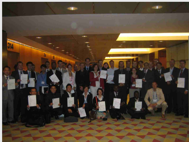
YPMTP-2007 participants holding their Certificates