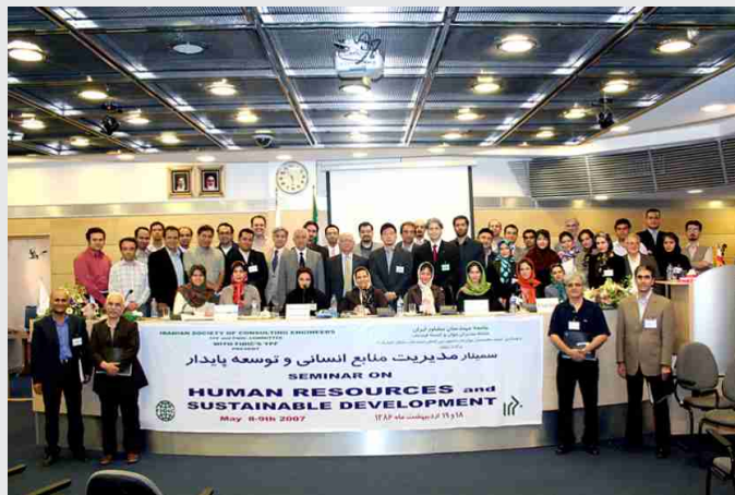
Human Resources and Sustainable development Conference 8-9 May 2007

ISCE YPF's two-day international conference was held on 8-9 May 2007 focusing on Human Resources and Sustainable Development.