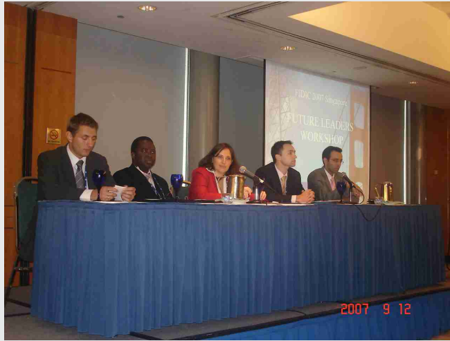
Future Leaders Workshop Presentation, Singapore 2007

The program is called the Future Leaders Workshop. It is attended by senior members of the FIDIC community, as well as junior and emerging leaders, for the opportunity to hear the voice of Young Professionals' regarding the emerging trends in the industry and the future of our professions.