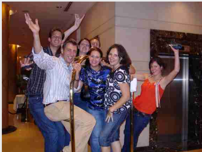
YPMTTP07 participants having fun

In addition to the preparation of a formal presentation, the YPMTTP program represents an opportunity for participants to network, make new friends around the world, and establish a network of professionals within the FIDIC community. An YPMTTP alumni network will be established on the ypf webpages of FIDIC website.