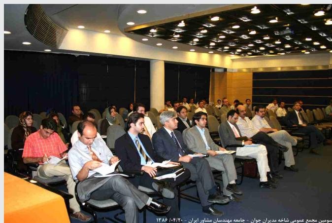
سومین مجمع عمومی شاخه مدیران جوان - جامعه مهندسان مشاور ایران - ۱۳۸۶ / ۰۹ / ۲۰ Third annual meeting - 11 July 2007

This year's program includes a seminar on Global warming due to take place on 14 November and a site visit to Tehran Tower (Iran's highest residential building) on 22 November.