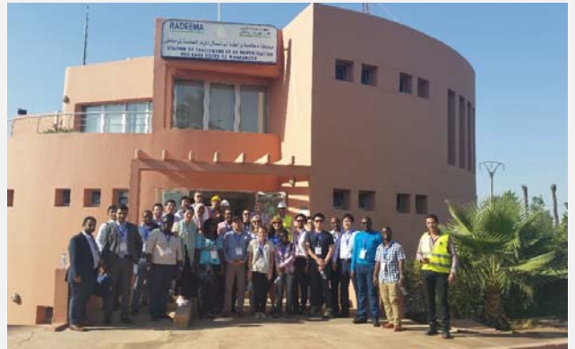
Technical Tour to Marrakesh WWTP

The Conference was closed by, Conference Closing session, General Assembly Meeting and Local Colour Night Dinner at "Palais Gharnata".