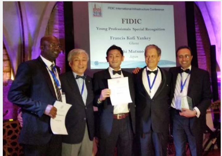
Winners for 2016 YPs Award

1 2 3 4 5 6 7 8 9 10 11 12 13 14 15 16 17 18 19 20 21 22 23 24