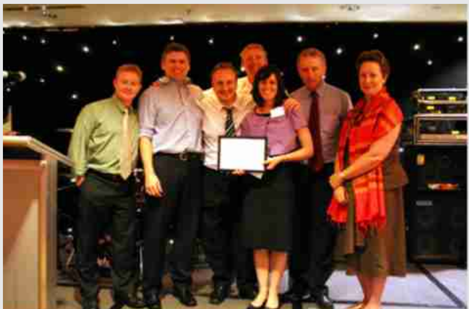
The winning team in 2008

For this component, teams of five or six worked together to prepare a masterplan for the development of a prominent site in Sydney. Each team had to prepare a written report, presentation and poster to convey their vision for the site. The teams met for two months to work on the project, and each team was assigned a mentor to act as a guide offering ideas and input. After the two month period the reports were submitted and each team presented to a panel of prominent individuals chosen as judges that included the director of a land development company, a past government minister and senior staff from government infrastructure agencies. The benefits of the team project and presentation were many, including: networking with other professionals, the opportunity to meet (and potentially impress!) the high profile judges and mentors and working closely with other professionals on a challenging project.