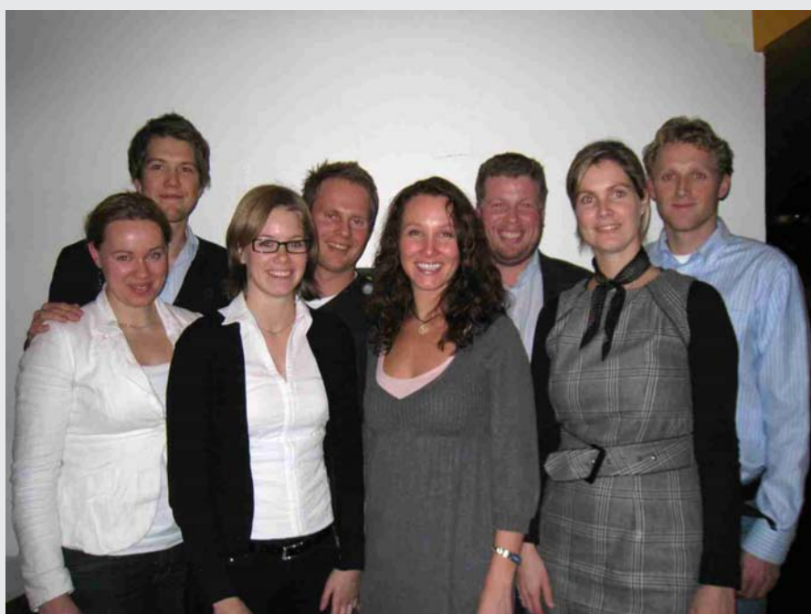
uRIF juleavslutning - 2008-12-17

In the future we will keep up the good work! We will continue our work with courses, articles and nominations. We will also continue our presence in FIDIC and EFCA. Currently we are in the process of establishing two local RIF's young professionals boards in the second and third largest cities in Norway, Bergen and, Trondheim.