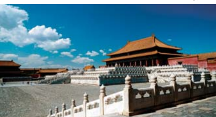
Yonghegong Lamar Temple