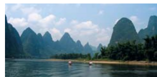
Guilin and Shanghai