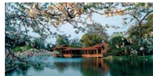
Xi'an and the Three Gorges