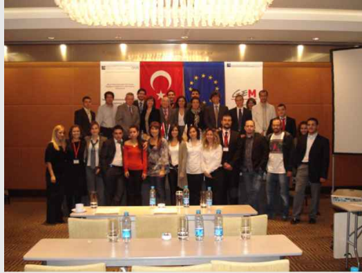
GEM and ATCEA members in family photo at the closing of 1 st GEM Conference