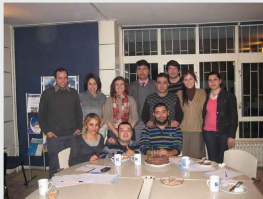
50 th Coordination Meeting was celebrating