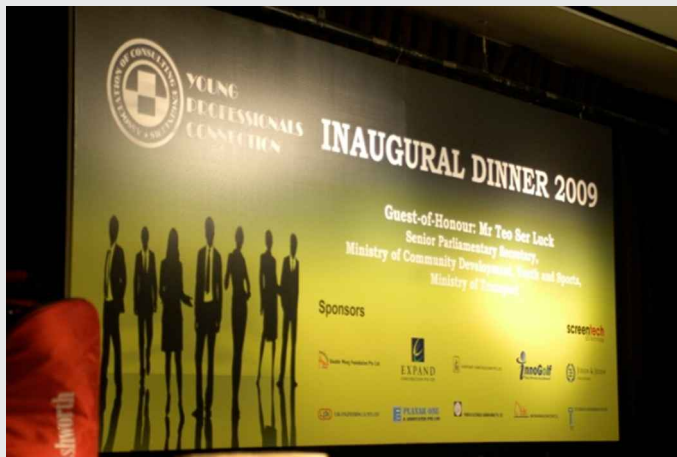
YPC Inaugural Dinner 2009

In May 2009, YPC also successfully organized an inaugural dinner to raise funds for our activities. The occasion was very well received by members of the industry.