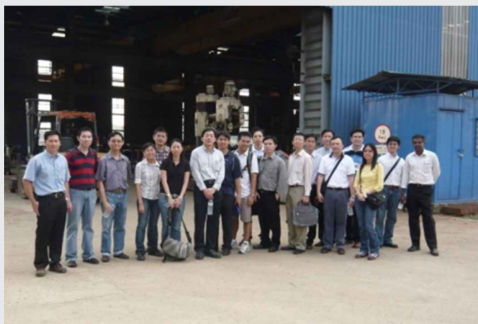
ACES Visit to steel fabrication yard

To date, we have 70 Young Professionals actively participating and benefiting from our activities.